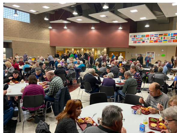
Members enjoying dinner at the 2023 Annual Meeting.

Watch for more information about the Annual Meeting and how to vote by mail in next few issues of HighLines as well as on our Facebook page and other social media pages.